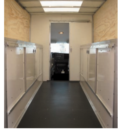
Shown with optional plywood lining and Unifloor

Shown with optional aluminum ladder rack and removable access ladder