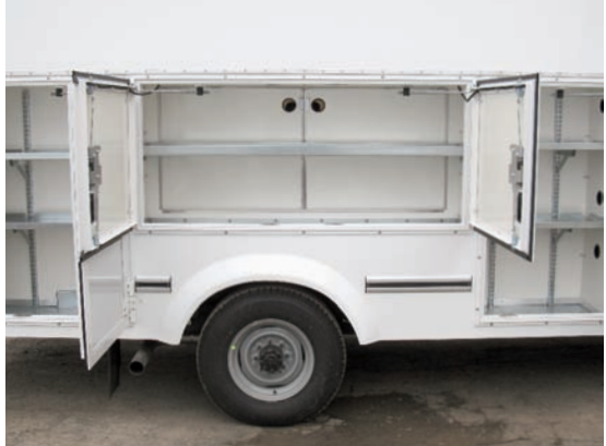
Shown with optional interior middle compartment access