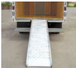
Aluminum sliding walk ramp

Some available equipment. View more on our website at www.unicell.com