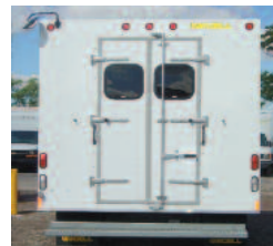
Narrow swing-out rear doors with windows