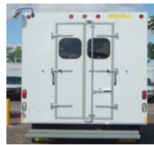
Narrow swing-out rear doors with windows