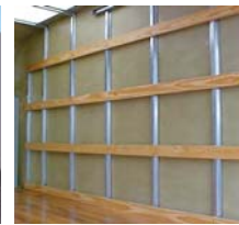
Standard slat lining