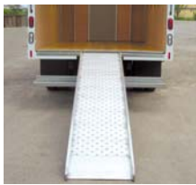
Aluminum sliding walk ramp

Some available equipment. View more on our website at www.unicell.com