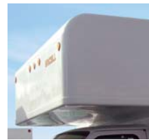
Attic storage over cab